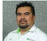
ADZMAN TECH CONSULTANT